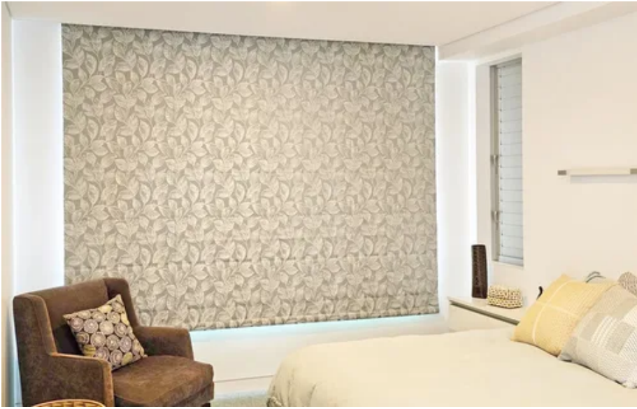
Roman Blind installed by our East Auckland Team – Fabric Maurice Kain Orlando