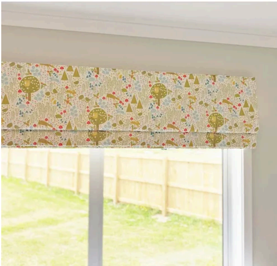
Installed by our Manawatu Team – Fabric Textilia Wildwood

Venluree's range of Roman blinds encompasses two distinct control options to suit different preferences and requirements. The traditional wooden batten method provides a classic aesthetic, while the chain-driven mechanism offers modern convenience and ease of operation. Both options are designed to ensure smooth functionality and long-lasting durability, providing peace of mind for homeowners.