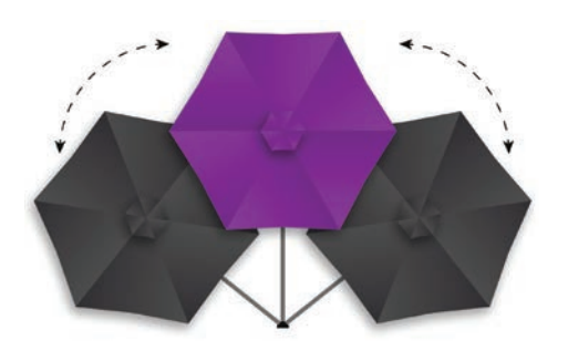
ROTATES Allows shade for the duration of the day.