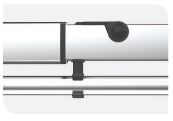
SHADOWREACH™ Extend for maximum shade reach.