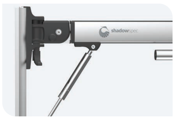
SHADOWLIFT™ Gas-assisted deployment for an easy lift.

The Shadowspec Retreat<sup>™</sup> is built from sleek, modern materials. We've handpicked the world's best to ensure longevity. Anodised Aluminium and 316 Stainless Steel work in harmony with our in-house design philosophy.