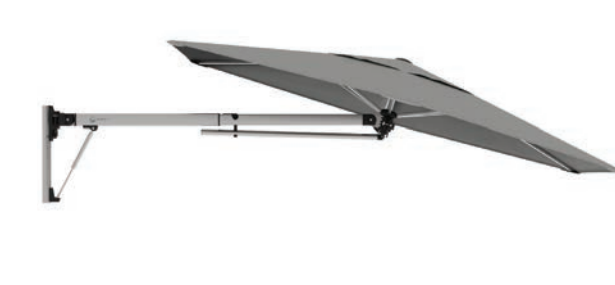
EXTENDS Away from the wall.

Two tilt positions to protect when the sun is low.