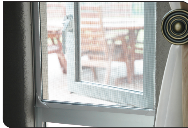
Unobtrusive when installed.