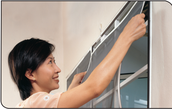
Easy to remove for washing or cleaning.